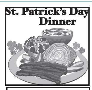
Sunday, March 18th 10:45 am - 1:00 pm Carryouts Available Hickory Smoked Ham ALL ARE INVITED

8:00 am Benediction and Mass at St. Gabriel's